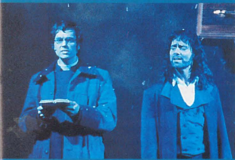
Cliff Richard in Heathcliff , which opened at the NIA, Birmingham, in October. See page 27