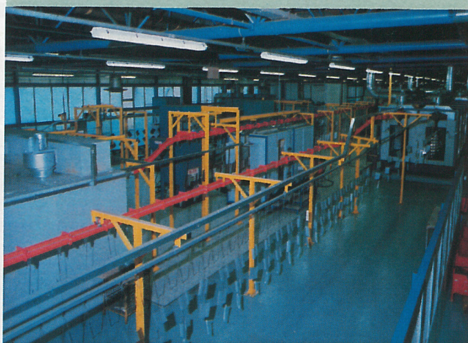
(Left) Automatic preparation and electrostatic powdercoat paint spray process plant. Occupies approximately 5000 sq.ft.

The third member of the Strand family is the Hong Kong sales office, here the territory is vast and varied. The countries of the Pacific Rim, South-east Asia and Australia & New Zealand provide an exciting challenge to the company's lighting