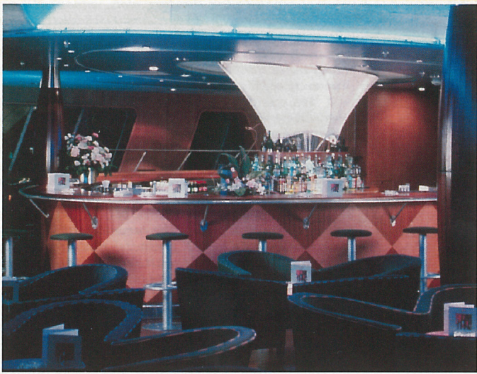
(Left) YACHT CLUB: A fine atmosphere in which to meet friends after a day ashore in some far-off exotic location.

Commissioning of new dimmer systems on board a ship in the midst of major refurbishment was never expected to be easy, and of course it wasn't. Try to imagine designers, plumbers, carpet layers, painters, carpenters, builders, electricians, audio engineers, and many others, the list was endless. All were working simultaneously, in the same areas and all trying to meet the same deadline. You may get the picture.