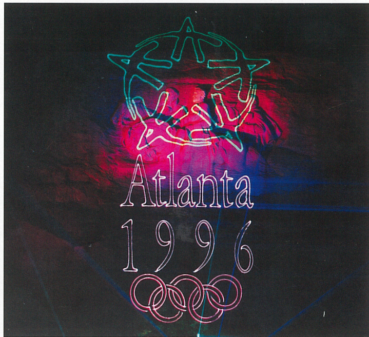
Laser Light Show. Stone Mountain Park.

T oday, millions visit a remarkable work of nature just a few miles outside Atlanta, Georgia. It is the world's largest granite monolith, formed some 300 million years ago by a surge of molten lava from beneath the earth's surface.