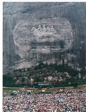
Memorial to the Confederacy, a few miles outside Atlanta, Georgia.

However, the park's appeal goes beyond history and serves as a complete family entertainment center. One event that thrills millions of visitors are the laser light shows. Every night during the summer, and at weekends during the remainder of the year, spectacular images are projected against the mountain. Dramatic stories, comical characters and graphic images are choreographed to popular music. It is the ultimate "Son et Lumiere" show. Such a show requires state of the art control