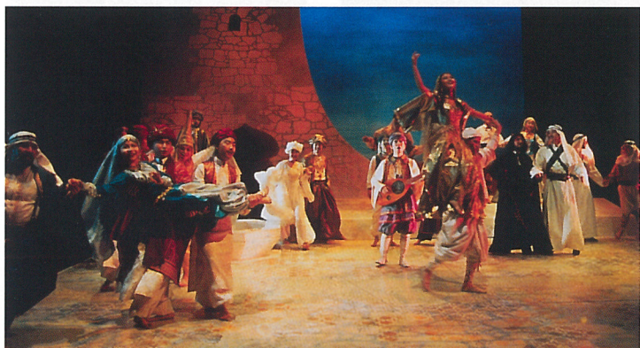
PALS at work...