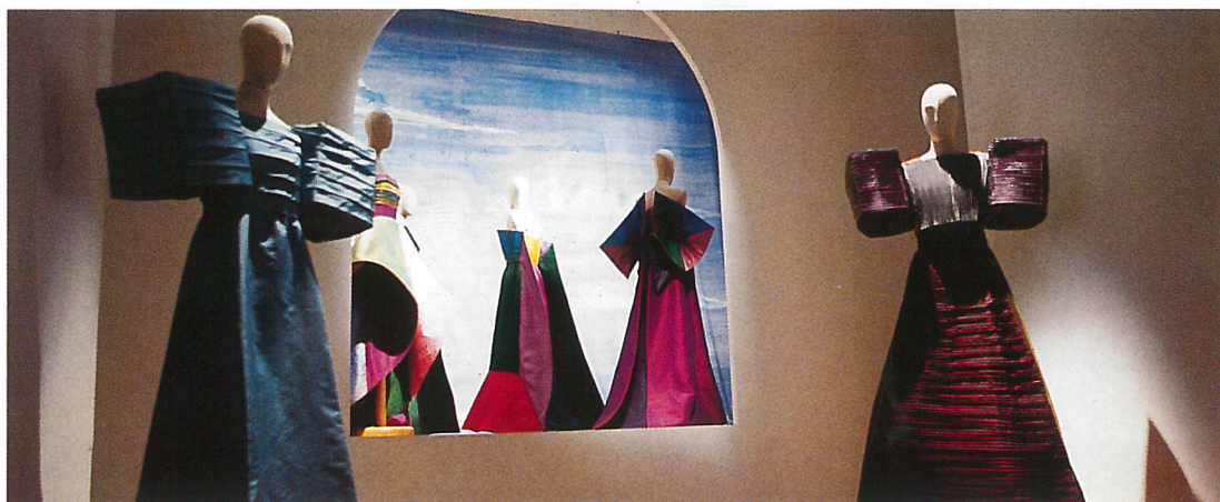
Minispots light the Roberto Capucci exhibition in Rome.