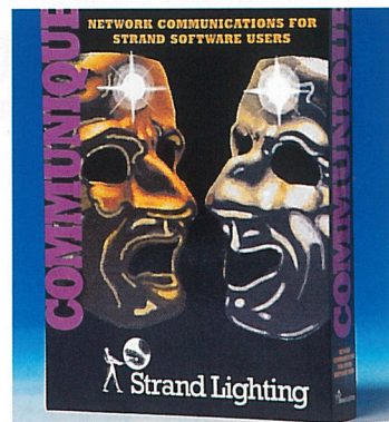
Communiqué™ Extension Software.