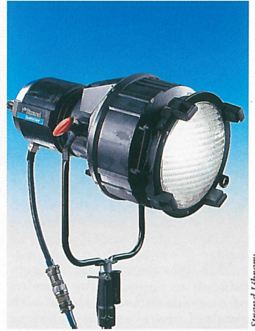
Quattro Quasar Mk 2

of dual wattage operation. When used with a suitably rated ballast, Super Quasar II can be used with either a 2500W or 1200W lamp, and with the Quattro Quasar II, either a 4000W or 2500W lamp may be fitted. Carrying the world famous Quartzcolor name, Strand are confident that the new generation of Super and Quattro Quasars will prove even more successful than the pioneering versions they now replace.