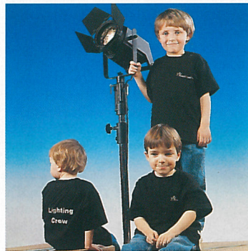
Junior "Lighting Crew" T-Shirts.

New for 1994 are the "Strand On Show" T-shirts, produced in black with the famous Strand logo on the front and a list of the shows and venues in cerise and yellow on the back. These are definitely collector's items and excellent value for everyone working on lighting. T-shirts are available in XL and Large. Junior T-shirts for the embryonic stage hands (with "Lighting Crew" legend on the back) are available for the children as well! See order card for more details.