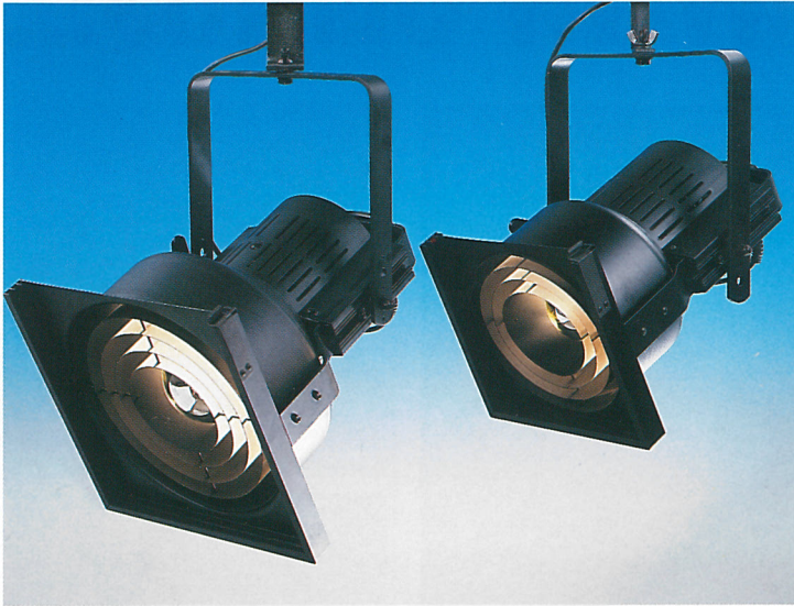
Beamlite 1000 and Beamlite 500.