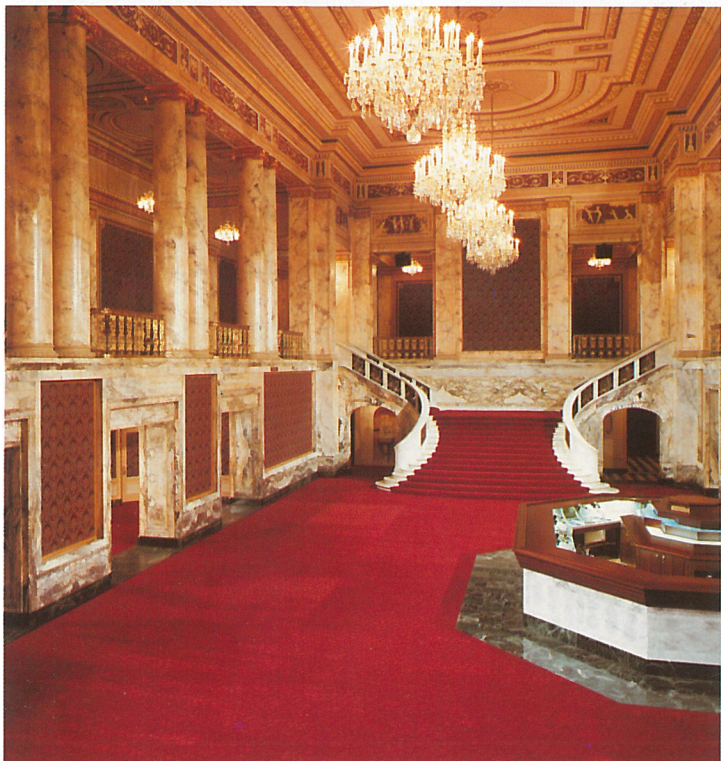
The elegant Grand Hall of the Palace Theatre looking towards one of the grand staircases