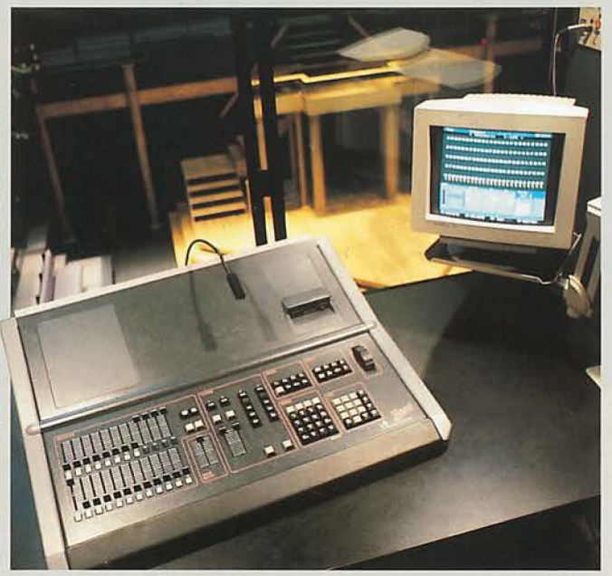
Mount Royal's new-look theatre

Lighting control is by an Impact and CD 80 dimmers.