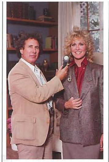
George Spiro Dibie's bands are all-important when taking light readings close to TV stars such as Joanna Kearns, of 'Growing Pains'.

Brighten your wardrobe with Strand T-shirts and sweatshirts and improve your knowledge with educational offers. PLUS your Strand contacts worldwide.