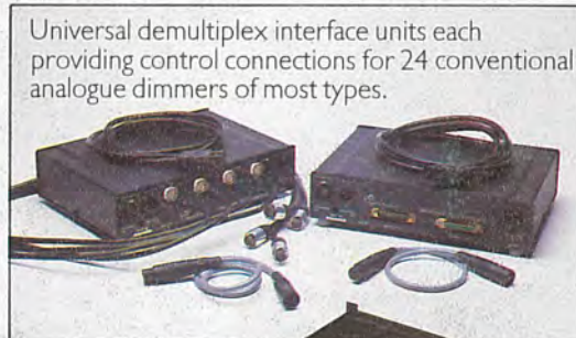
Universal demultiplex interface units each providing control connections for 24 conventional analogue dimmers of most types.