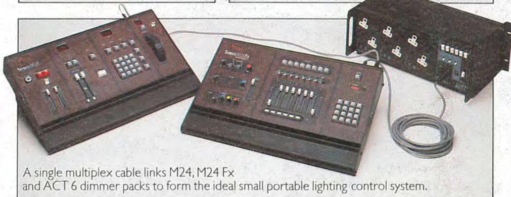
A single multiplex cable links M24, M24 Fx and ACT 6 dimmer packs to form the ideal small portable lighting control system.

The company reserves the right to make any variation in design and construction to the equipment described.