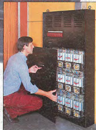
Permuc Multiplexed dimmers require only a two core screened control cable link to the M24 and M24 Fx desks.