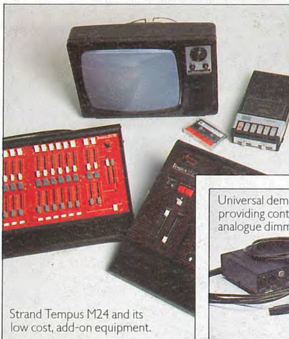
Strand Tempus M24 and its low cost, add-on equipment.