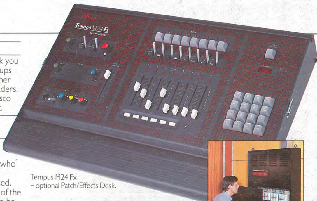
Tempus M24 Fx - optional Patch/Effects Desk.

The choice is yours to take as much, or as little as your situation needs. But only the quantity changes - the quality is constant.