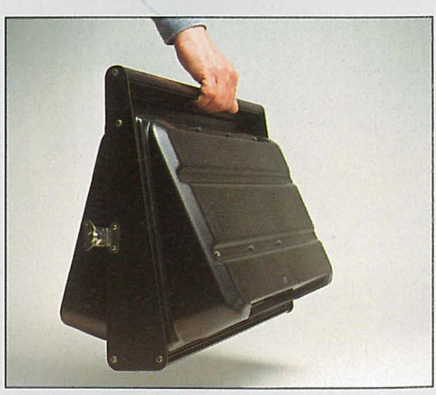
Control connection is multiplexed to dimmers by a single twin core screened flexible cable. Thus the M24 is its own stalls control desk for lighting rehearsals.