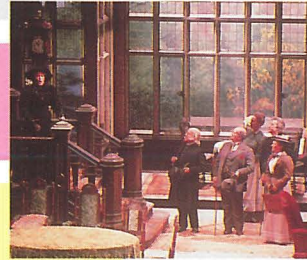
◀ At Glyndeboume Festival Opera Strand provide lighting control through a Galaxy 3. Pictured here is a scene from "Albert Herring".