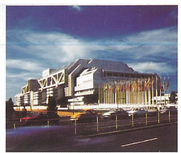
▲ The magnificent International Congress Centre, Berlin – Strand provide several facilities including lighting control by Strand Galaxy 3.