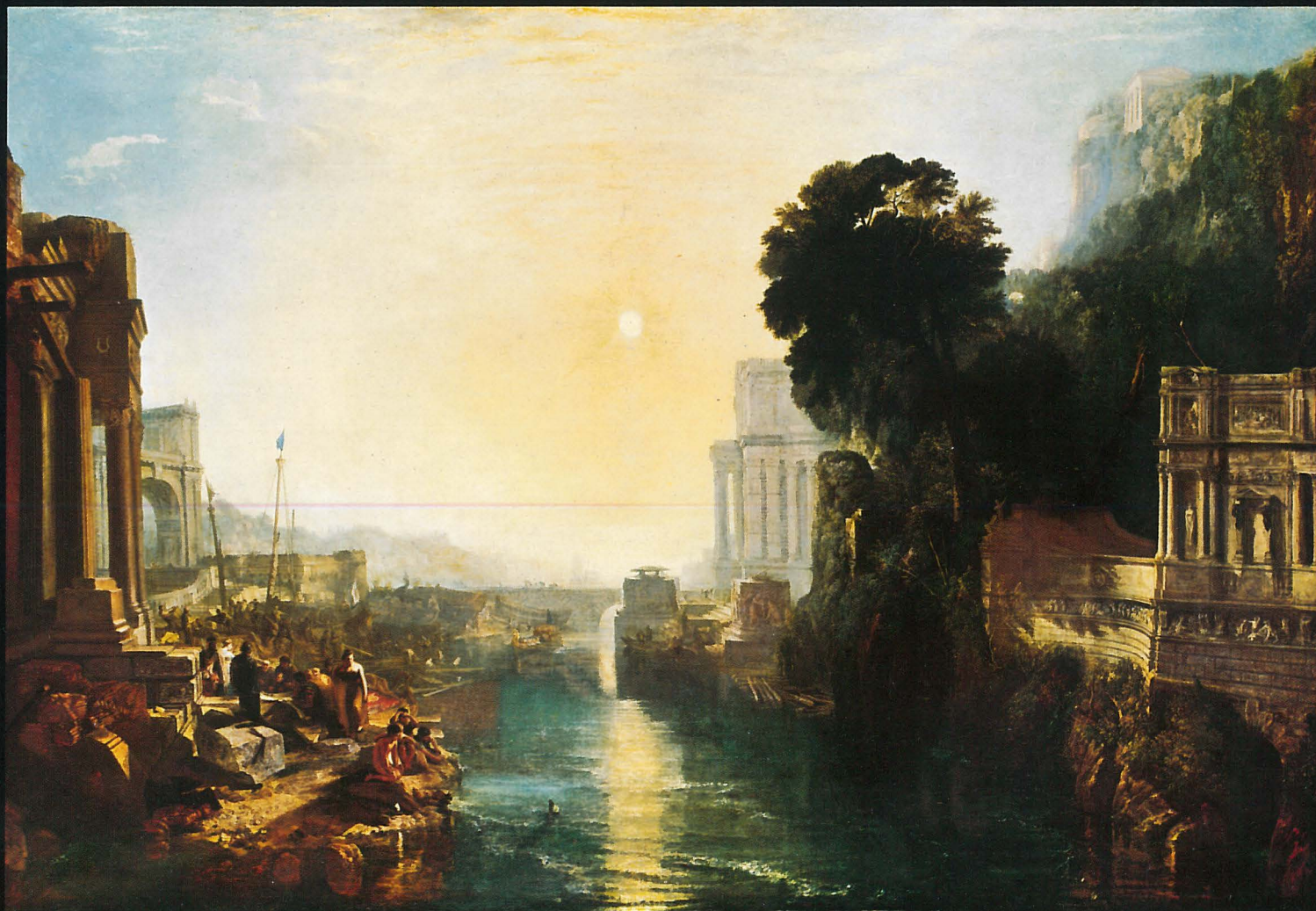
DIDO BUILDING CARTHAGE [TURNER]