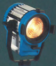
ARRI Junior 300W