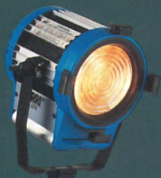
ARRI Junior 650W