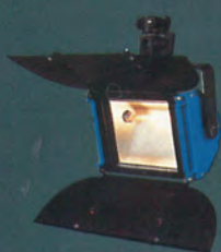
ARRI MINI-CYC 1000W