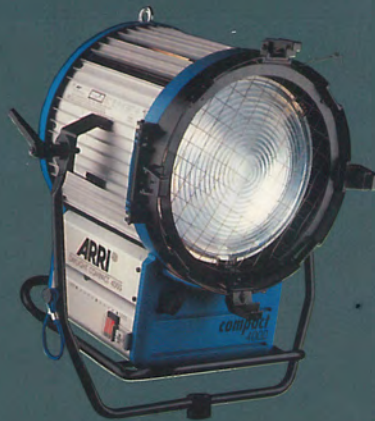
ARRI Compact 4000W