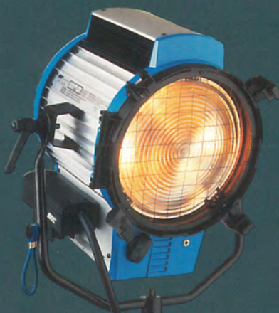
ARRI Junior 5000W