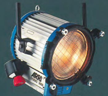
ARRI Studio 2000W