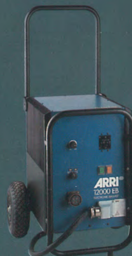
12000W Electronic Ballast