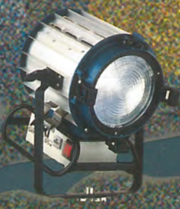
ARRI Daylight 575W