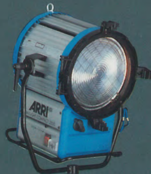
ARRI Compact 2500W