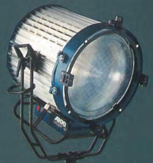
ARRI Daylight 4000W