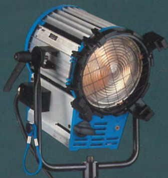
ARRI Junior 2000W