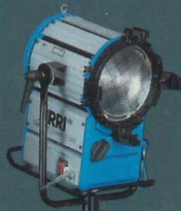
ARRI Compact 1200W