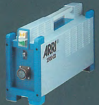
Electronic & Conventional Ballasts from 575-12000W