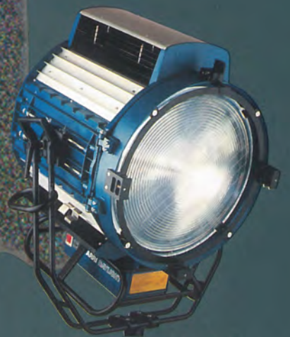
ARRI Daylight 12000W

Uncompromising engineering and superb optical quality will keep the ARRI Daylight range the DP's preferred light source for many years to come.