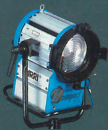
ARRI Compact 575W