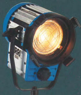
ARRI Junior 1000W