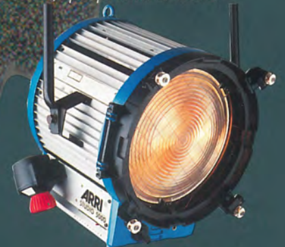
ARRI Studio 5000W