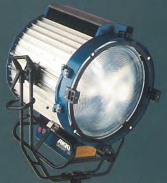
ARRI Daylight 6000W