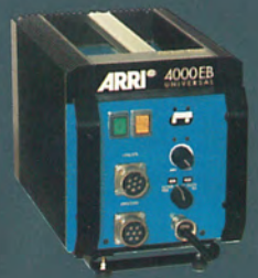
Universal Electronic Ballast, 575-4000W