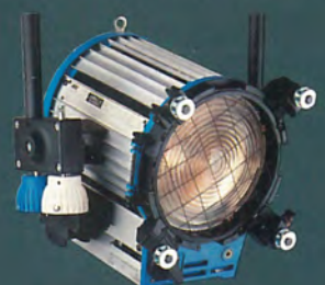
ARRI Studio 1000W