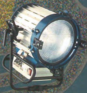
ARRI Daylight 1200W