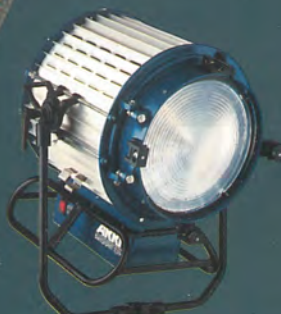
ARRI Daylight 2500W