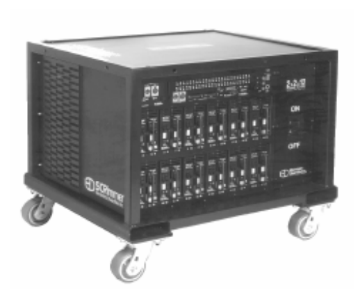
2 x 2 x 12 Road Rack