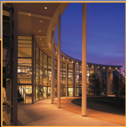
Copia: The American Center for Wine, Food & the Arts