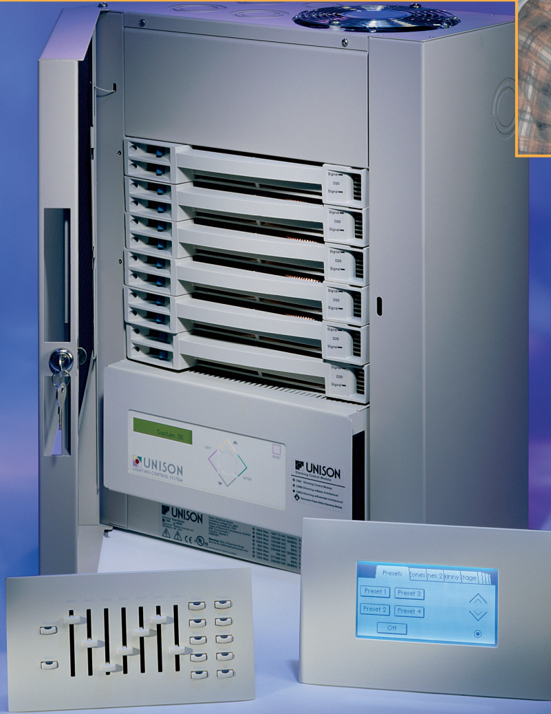
Unison DR6 (12 circuit), Fader Station, and configurable LCD Touchscreen