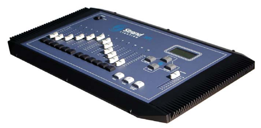
301backup Lighting Control Console

The 301 console is a versatile multifunction console that may be used as a backup to any DMX512 lighting system and as a manual desk. It may also be used as a timed event controller.