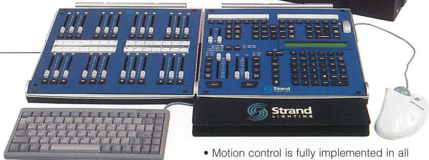
Optional Mini Keyboard. See Peripherals on Page 10.