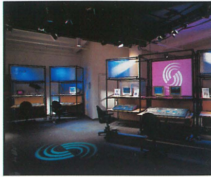
New York office

Strand Lighting offers the world's most comprehensive and competitive range of luminaires, dimming equipment, control systems and software to answer the creative needs of lighting designers working in theatre, television, film, themed environments and sophisticated architectural applications.