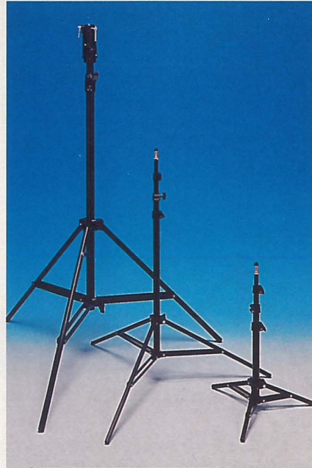
SELECTION OF NEW BLACK FINISH STANDS