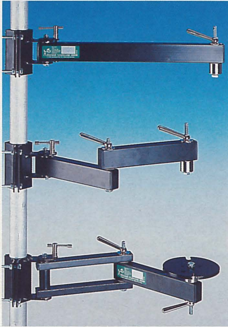
SWIVEL MOUNTING BRACKETS