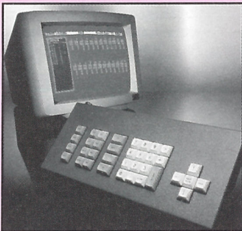
PC Controller and VDU