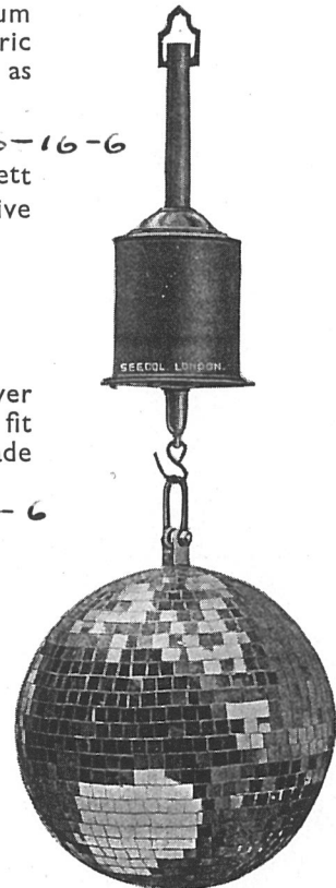
Mirror Ball and Rotator

C 110 Electric motor rotators, from ... 6-0-0 6 15 0