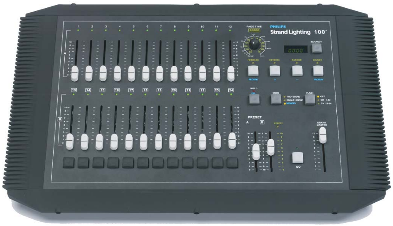
100 plus series 12/24 Lighting Control Console

The 100 plus series console is a small, simple to use, preset lighting control desk that also has a theatrical cue stack of 99 memories. It can be operated in 24 channel single scene mode or 12 channel two scene mode. In single scene mode multiple scenes can be set with the Hold feature. The console also has the ability to run a single effect.