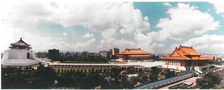
The Park showing Chang Kai-Shek Memorial (left) with the National Theatre (centre) and Concert Hall (right)