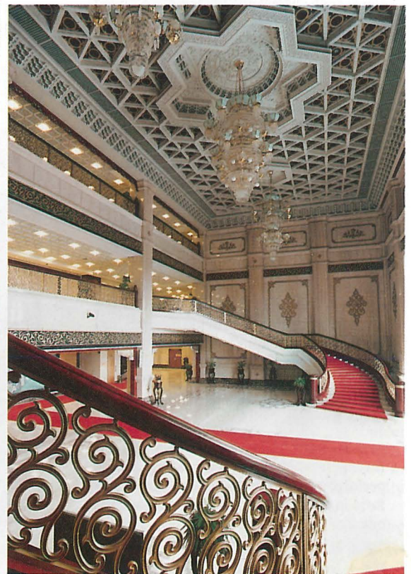
Grand Lobby National Theatre