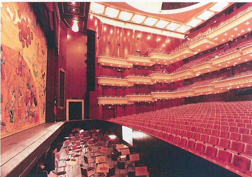
National Theatre auditorium (seating 1524)