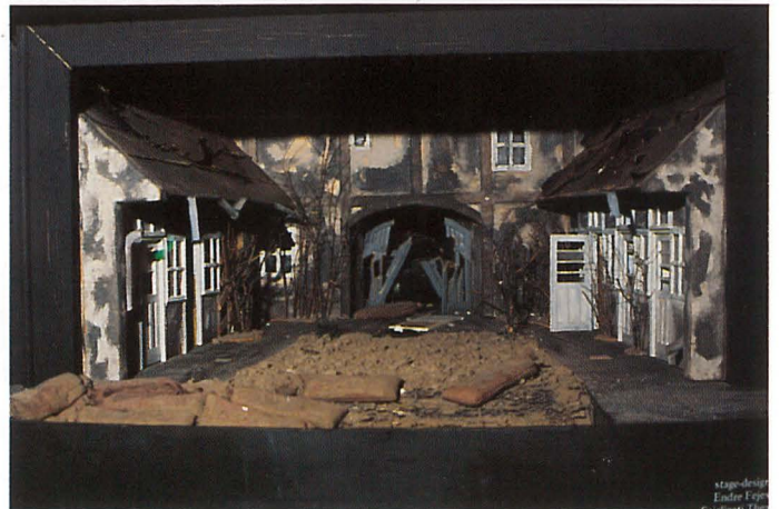
Ignac Vono – Csaba (Hungary)