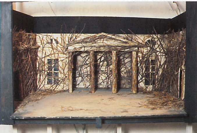
Ivanov – Borovsky (USSR)