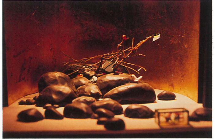
Summer Nights on the Earth – Ulla Kessiuis (Sweden)