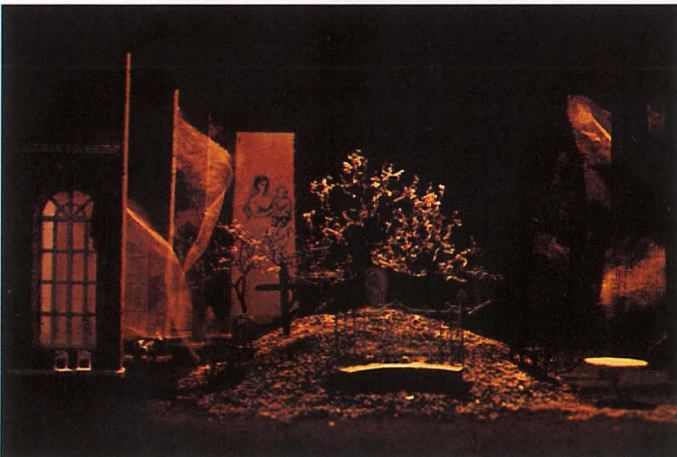
The Cherry Orchard – Valen Lavental (USSR)