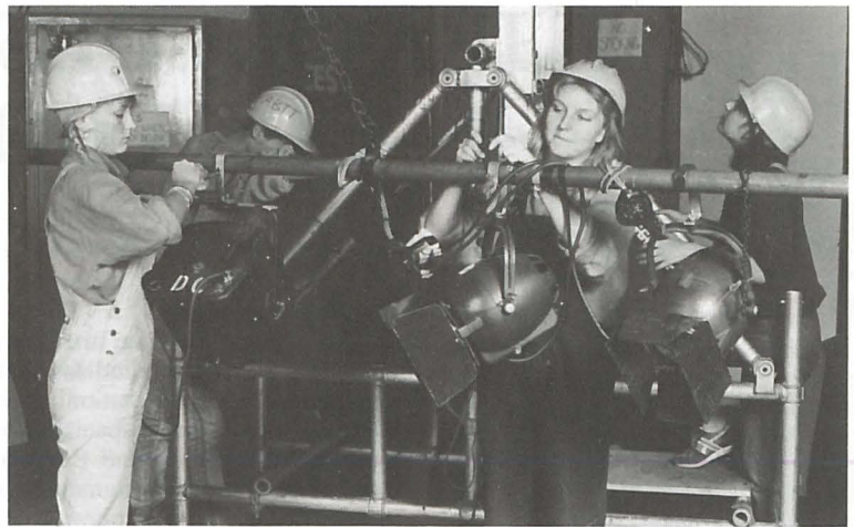
Students rigging lights.