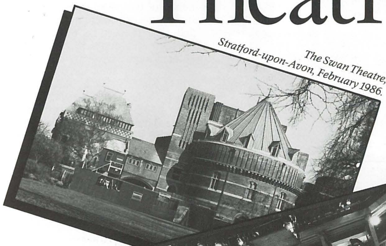
Stratford-upon-Avon, February 1986. The Swan Theatre,

Strand Lighting wish all success to the RSC's new venture at the Swan Theatre - to be a centre for the production of works by Shakespeare's contemporaries.