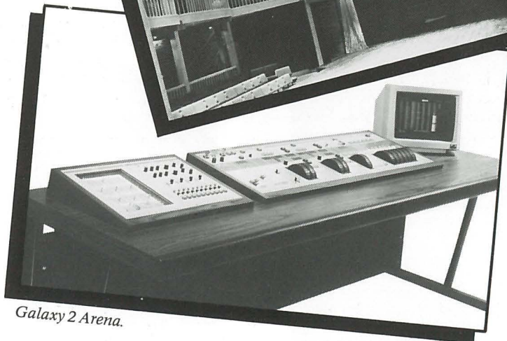
Galaxy 2 Arena.