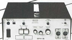
CS-210 2 Channel Main Station