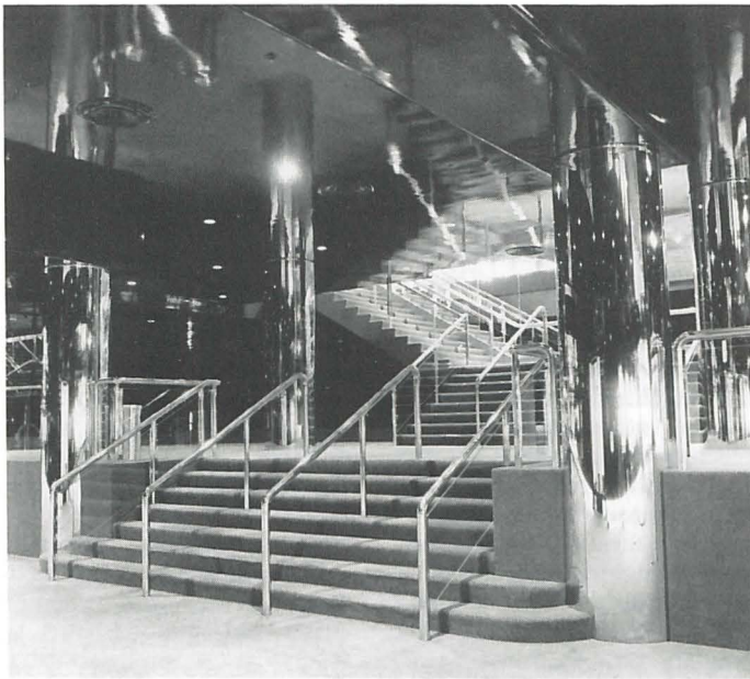
Visual excitement is given full opportunity in the foyers.

conferences) in the sixties but has in practice turned out to be something of a red herring in the quest for discovery of the true nature of audience/actor contact. Like so many restrained thrusts, it rapidly loses significance with every row that one is removed from it. However the auditorium is very comfortable, although I do find that the Australian preference for high seat backs in the upper regions seems to increase circle rakes, both in reality and in illusion, to a degree that causes me personal unease when