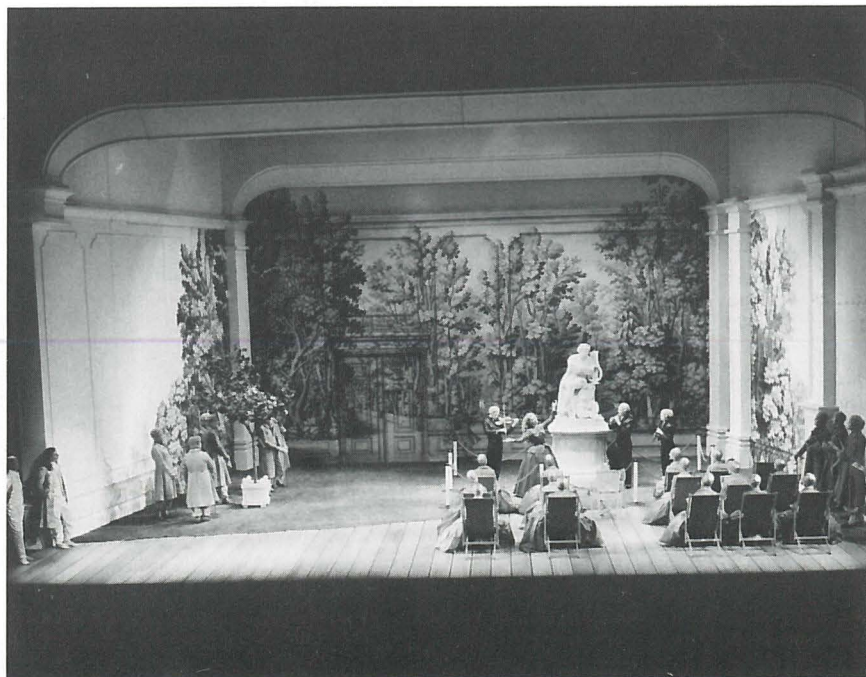
English National Opera's 'Xerxes'. Producer Nicholas Hytner. Designer David Fielding. Lighting Paul Pyant.