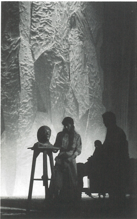
Joe Vanek Terra Nova by Ted Tally, Watford Palace Theatre, 1982

More than 100 art reproductions of models of set designs, photographs of set designs in performance and costumes, several in full colour, comprise the contents of this magnificent 64-page volume. Copies may be obtained at the exhibition, from the Society of British Theatre Designers or from CUE, price £4 including postage.