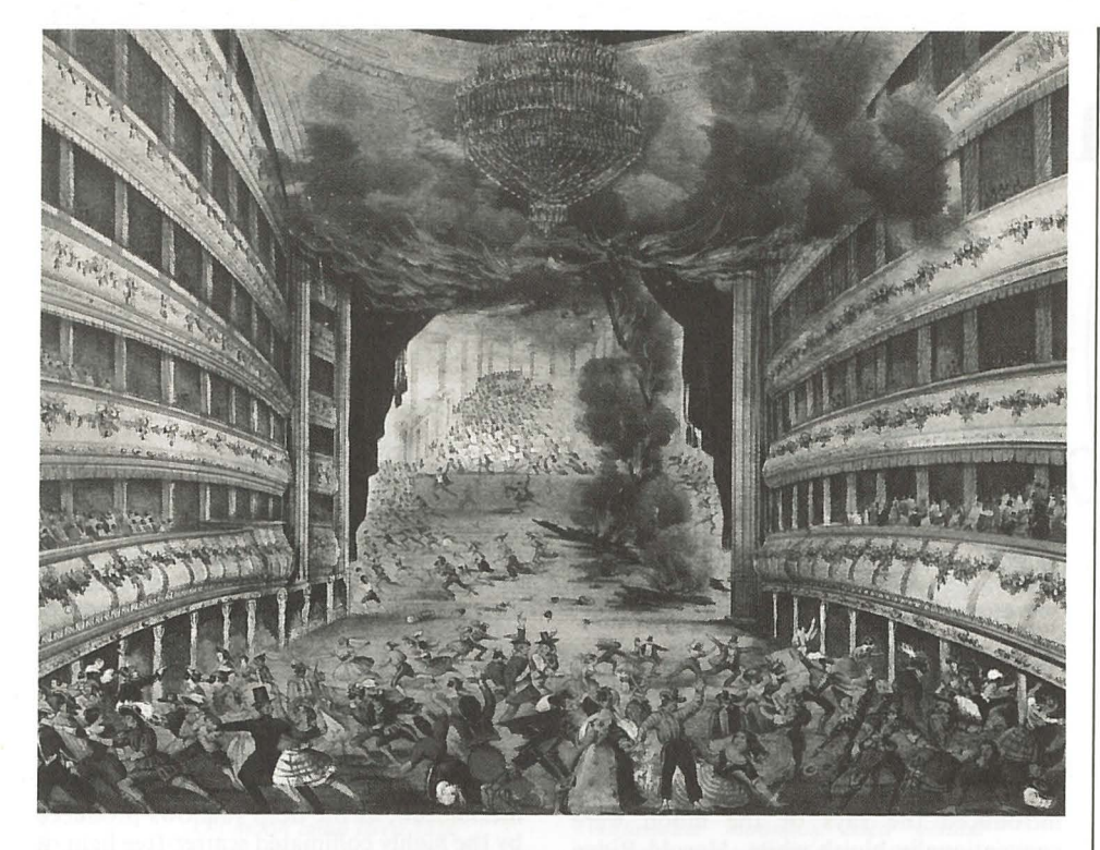
Contemporary prints of two London theatre disasters, reproduced as Theatre Museum Postcards: (above) The start of the Covent Garden Fire of 1856 and (below) The collapse of the Brunswick Theatre in 1828, caused by the walls being too weak to support the iron roof.