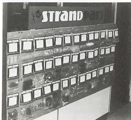
Rank Strand over the counter spare parts service.