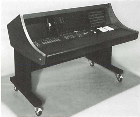
Rank Strand Light Palette.

Thorn have been awarded a contract by the BBC for their Thornlite 500 systems. These are to be installed at Television Centre, the Cardiff Studios and the Open University. The smaller Thornlite 120 is being supplied to ORF Vienna and Finnish Television.