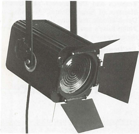
CCT Minuette Fresnel.