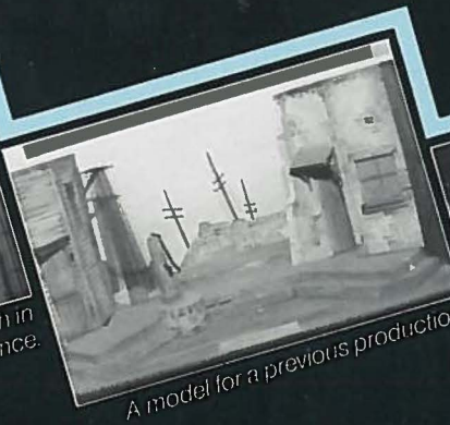
A model for a previous production.