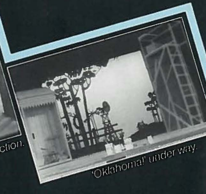
'Oklahoma!' under way.