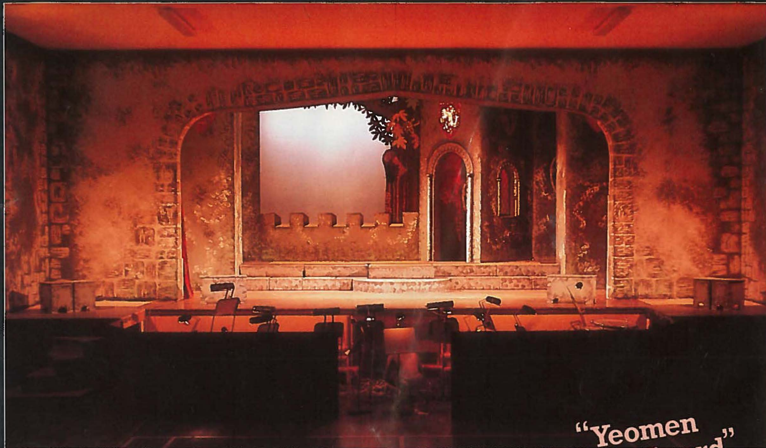
“Yeomen of the Guard”

However, here are a selection of some of these excellent contributions: Our thanks to everyone who wrote in – a Strand Lighting £25.00 gift voucher goes to all the authors whose articles we had space for.