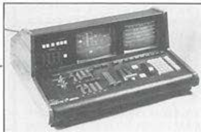
Mini Light Palette.