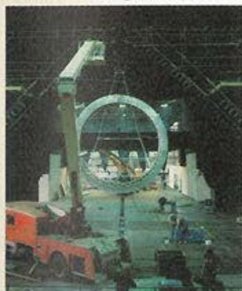
The circular screen goes into position

I'm sure everyone hopes that the new car will be a winner for Leyland, it has certainly had an impressive launching thanks to the expertise of the team who put together the biggest piece of industrial theatre ever staged in Britain. Congratulations to all concerned! ■