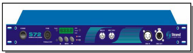
S72 Strand Demux 72-way DMX -Analogue Demultiplexer