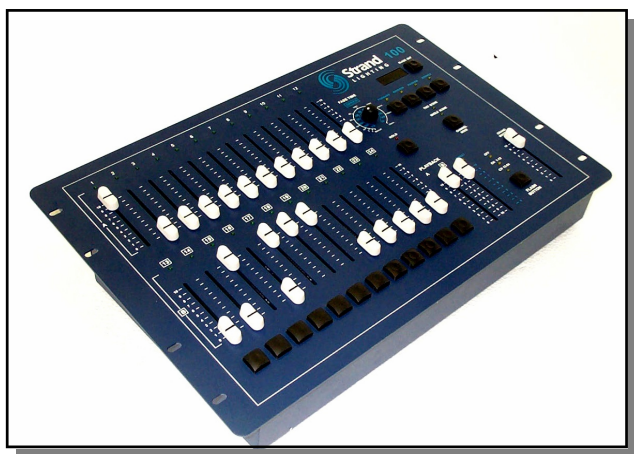
100 Series Control Console