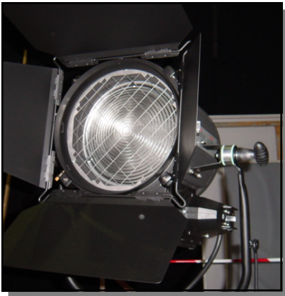
Quartzcolor 6kW HMI Fresnel

Strand introduces 2 new high-powered HMI location lights under its Quartzcolor banner: the 6kW Daylight Fresnel, and the 6kW Day LITE PAR. These new HMI lights use the MSR 6000W single ended lamp (G38 base), and have new, specifically designed lens and reflector systems. These new enhancements offer superior optical performance, and significantly higher light output. Both heads are manufactured to the same high quality standards that you would come to expect from Quartzcolor. They're rugged, durable, and above all – light weight: 40kG (88lbs) for the fresnel, and 33kG (73lbs) for the PAR. Other enhancements include a newly designed 3-rail guide system, coupled with a centrally aligned rear focus knob provides smooth and precise focus adjustment. The newly designed lens doors feature cast aluminum ears with encased bearings for smooth barndoor or lens rotation. PAR lenses are mounted in colour-coded frames for