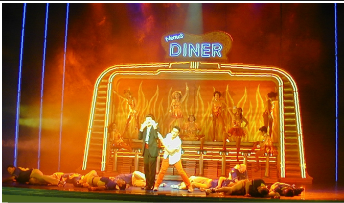
The Witches of Eastwick at Melbourne's Princess Theatre

The second transfer is The Witches of Eastwick which, when it opened at London's Theatre Royal Drury Lane in July 2000 and had one of the largest automated rigs seen in the West End. The show used two Strand consoles