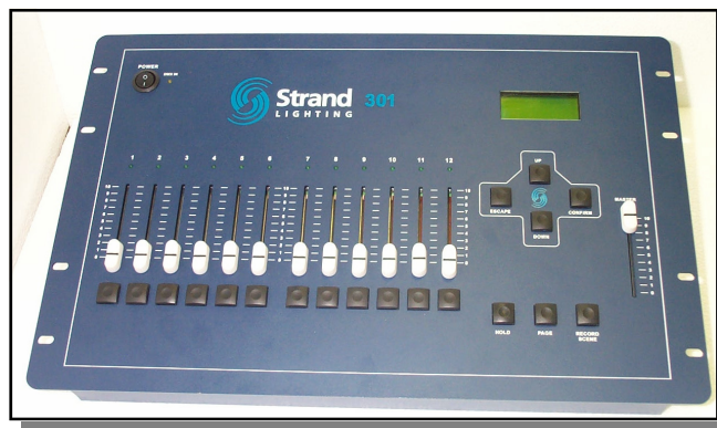
301 Back up Control Console

cations. The 301 can also serve as a 12-channel manual console with DMX patch. It can also receive up to 12 analog inputs, and uses an LCD display for set-up and configuration. An audible 'DMX Fail' warning sounds in the event of DMX interruption, and provides an automatic bypasses on system failure. The 301 is designed for either table or 19-inch rack mounting (7U high), and is available with either a 120V UL/cUL or 230/240V CE power supply.