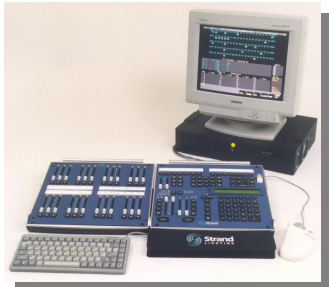
Strand 300 Series Console

Recently a building used by Weston-super-Mare College was sold for re-development, The Department of Creative Arts and Design needed to re-locate part of their Drama teaching facility into the main college building. The department already had drama teaching studios, a facility for HND