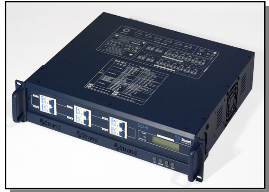
SD 6 Rack Mount Dimmer Pack

front panel keypad and LCD display. 24 back up cues are available along with the capability of linking multiple packs. Dimmers have individual Min/Max settings and curve selection. Chase and scene pattern libraries are on board for stand alone operation. Both packs are available with numerous output configurations. The SD 6 has a single output per dimmer, while the Act 6 Digital has dual outputs. Both of these new units are CE marked.