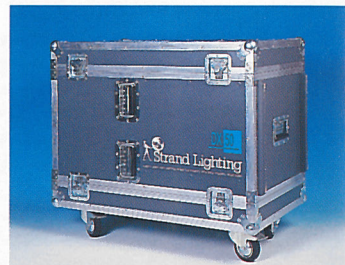
Andi DX housed in robust flight case.

Available with a choice of load sockets suitable for the UK, France or Germany or with multipin connectors for multicore cable installations, all Andi DX touring dimmer racks are designed and manufactured in compliance with mandatory European safety regulations. The incoming mains supply is provided by a CEE 5-pin standard connector on the rear of each rack. Andi DX is in production now and extends our already well established base of Andi permanently installed dimmer racks throughout Germany.