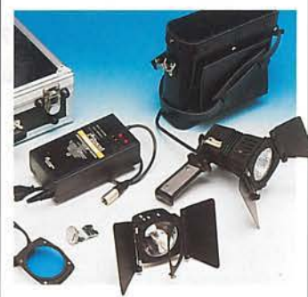
A new era dawns for suspension systems and new lights are designed for electronic news gathering.