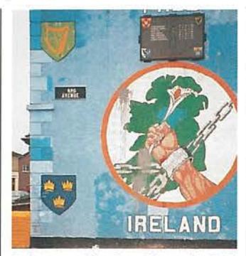
Religion and politics have divided Ireland for generations. But on both sides of the border, the lighting industry proves the old saying 'the show must go on'.

Strand Lighting has featured large in entertainment and architectural lighting for most of the 20th century. We look at some notable 'Strand Firsts'.