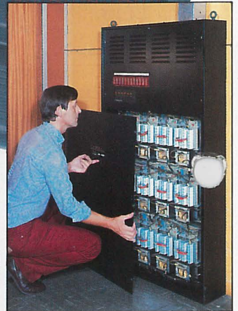
Permux Multiplexed dimmers require only a two core screened control cable link to the M24 and M24 Fx desks.