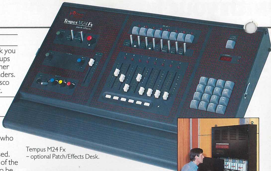
Tempus M24 Fx - optional Patch/Effects Desk.

Almost certainly Yes! Contact Strand or your local dealer. The choice is yours to take as much, or as little as your situation needs. But only the quantity changes - the quality is constant.