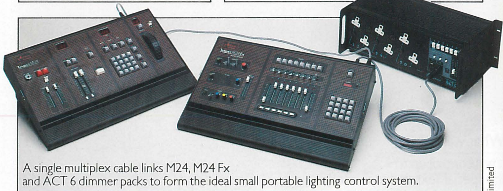
A single multiplex cable links M24, M24 Fx and ACT 6 dimmer packs to form the ideal small portable lighting control system.

The company reserves the right to make any variation in design and construction to the equipment described.