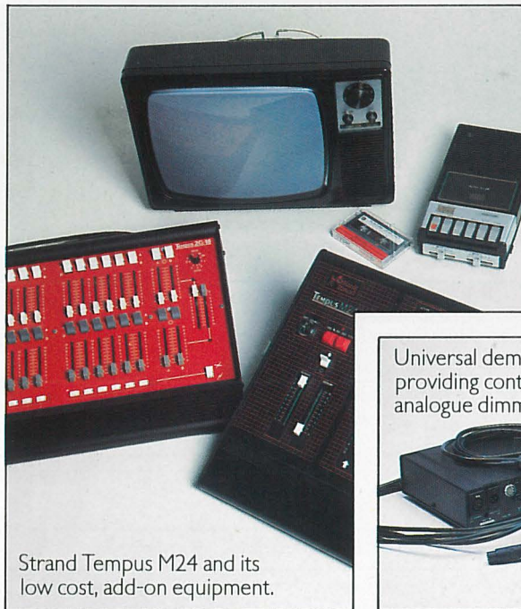
Strand Tempus M24 and its low cost, add-on equipment.

Universal demultiplex interface units each providing control connections for 24 conventional analogue dimmers of most types.