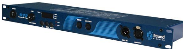
65011 Digital to Analogue Demultiplexer