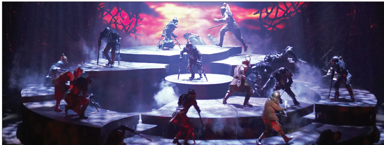
Above: The arrangement of revolves and lifts is clearly visible in this battle scene.

Sound favourite, LDS400s, as Orchestra cross-fills: "The idea was really to have all of the sound of the orchestra and the cast singing focussed to the stage. We also knew the show would have to get really loud and we needed a big rig able to handle that," Severson smiled.