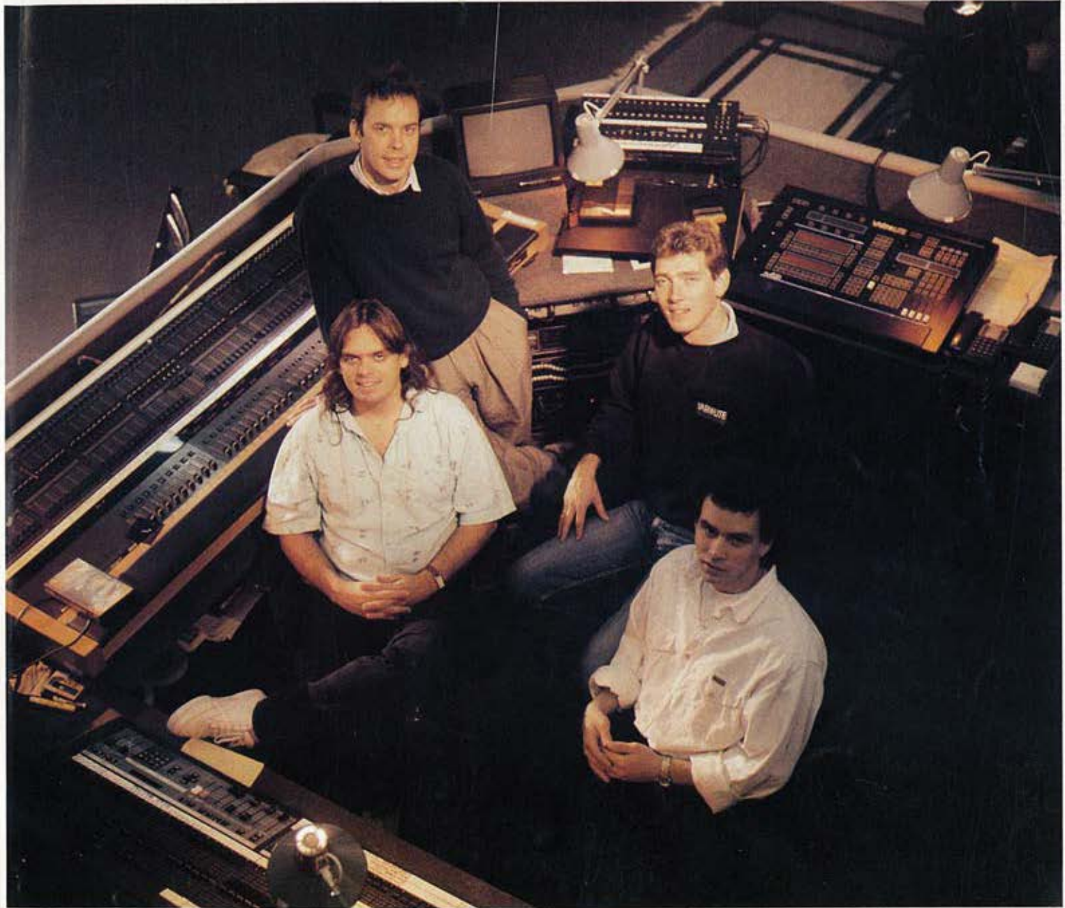
IN CONTROL AT 4:1