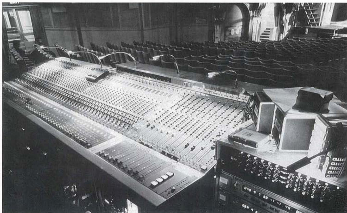
The Cadac Console in situ for the production of Follies is identical to that used on Into the Woods.

Bruce explained: "We have computer-produced working diagrams on how it's all put together, with details such as the number of