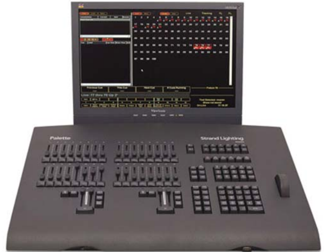
classicPalettell Lighting Control Console

Clean, elegant, and very, very powerful, classic Palette II is a thoroughbred. Starting at 250 channels, classic Palette II can be expanded to 8,000 channels. And with two playbacks and 32 submasters, classic Palette II will eat up complex shows, easily – elegantly.