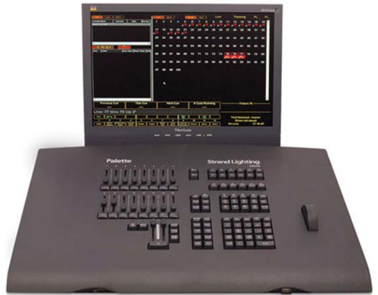
basicPalettell Lighting Control Console

Clean, elegant, and very, very powerful, basic Palette is a thoroughbred. Starting with 250 channels, a single playback and 16 submasters, basicPalettell will allow you to program complex shows, easily – elegantly.