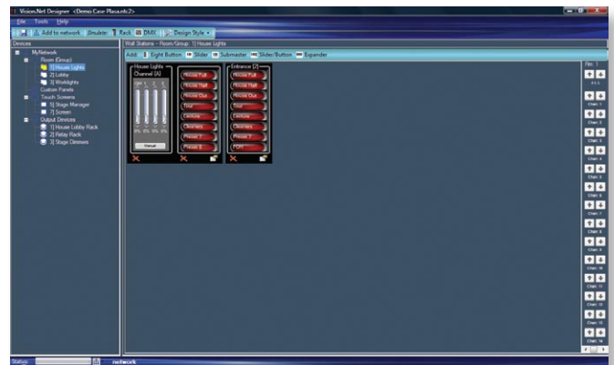
Vision.net Designer set-up screen