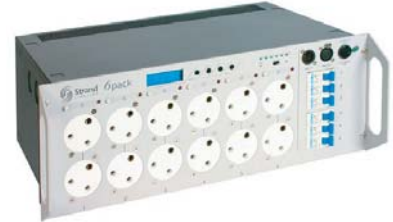
6pack Digital Dimmer 6 x 10A (Dual 15A)