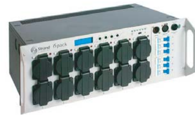
6pack Digital Dimmer 6 x 10A (Dual Schuko)