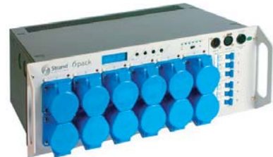
6pack Digital Dimmer 6 x 10A (Dual CEE17)