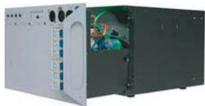
The sliding electronics tray gives easy service access even after installation.

The simple control interface enables users to set DMX512 address, minimum/maximum levels and dimmer curves channel by channel. One of three dimmer curves, including linear, non-dim and square law may be assigned to each dimmer.